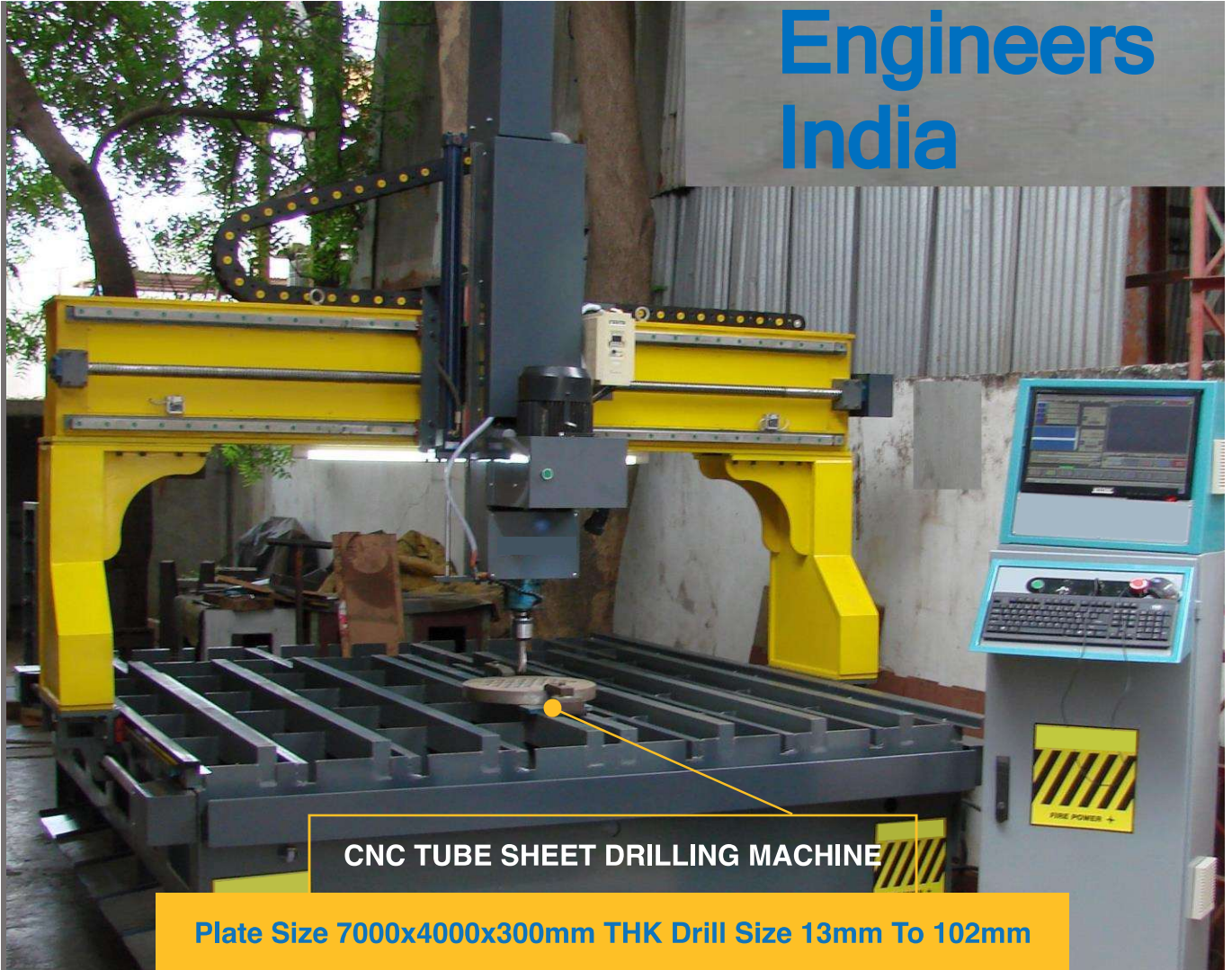
CNC TUBE SHEET DRILLING MACHINE

Plate Size 7000x4000x300mm THK Drill Size 13mm To 102mm